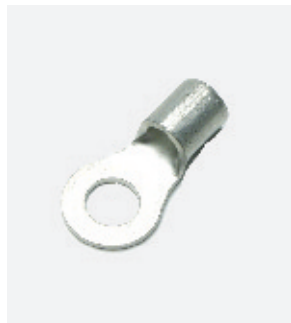
Svetsad hals. Tennpläterade